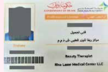
Trainee DHA License